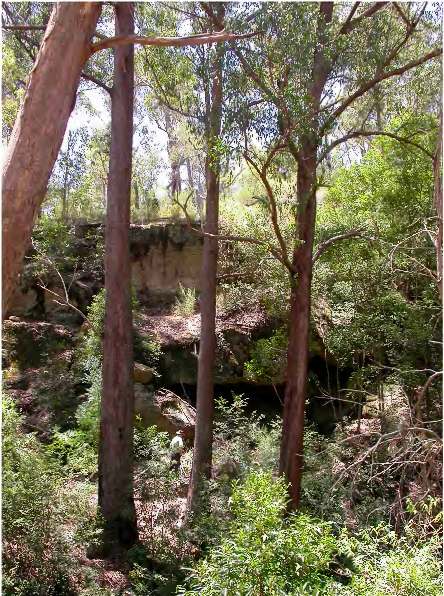
Fig. 2. Habitat and habit of Eucalyptus expressa (three centre trees; leaning tree in upper left is E. piperita ) - Parsons Creek alongside Putty Rd, SW of Bulga, 32°45'07"S, 150°55'22"E, 30 Jan 2009, Nicolle 5265 & Bell (AD, CANB, NSW, BRI). Note one of us (SAJB) in image for scale.